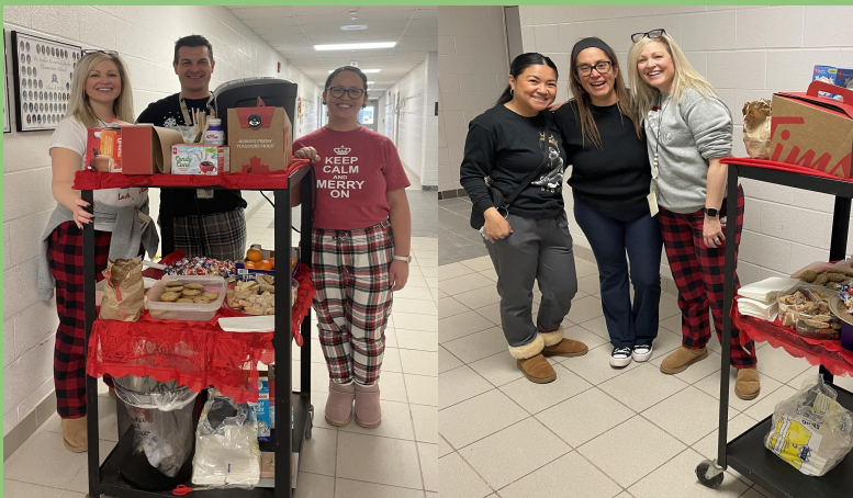
Special delivery! Giving teachers coffee and sugar on the last day of school!

Each class decorated a gingerbread house.