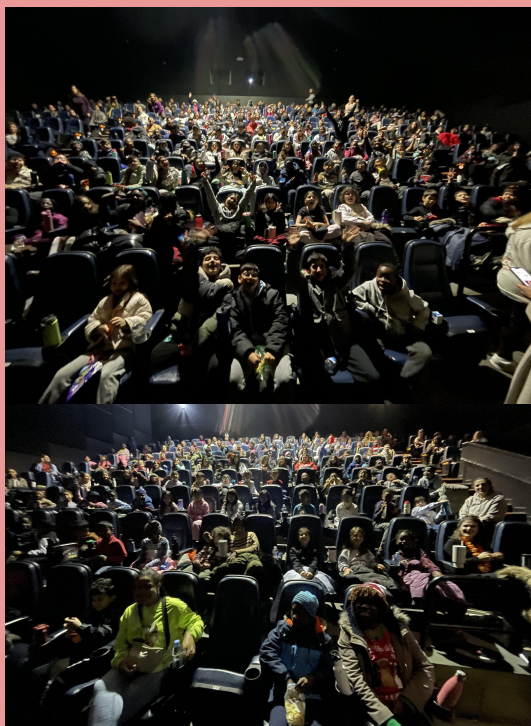
Bessette at the movies! Moana 2.

Thank you to our Youth Faith Leaders for organizing such a fun spirit week! The Christmas spirit was strong at St. Andre Bessette! There was art, caroling in the hallways, guess the Christmas song, Christmas scavenger hunt and more. Thank you also for all the donations of non-perishable food items and gift cards. These were delivered to families in our community that were in need of extra support this season.